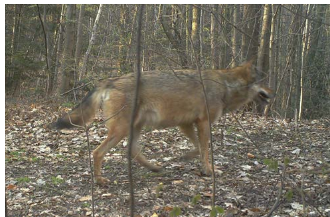
A wolf recorded by the photo-trap in Świętokrzyski National Park

This year, single wolves were recorded twice in the National Park. A photo-trap recorded a wolf in Bukowa Góra in February. In March, a single wolf was spotted crossing the public road 752 to the Podgórze Protection District of the National Park.