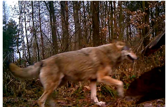
A wolf recorded by the photo-trap in Ilzecka Forest