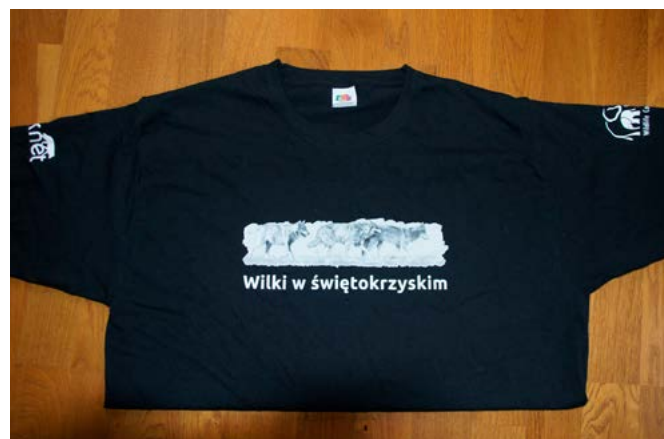
T-shirt promoting wolves in Świętokrzyskie Region