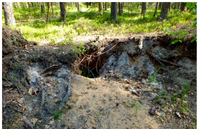
A wolf den found in Siekierzyńskie Forest

On the 1 st of September 2018, wolves of this forest responded to our howling stimulation. There were adults and pups howling, but the wolves were too far, and it was not possible to count how many. When we approached them, only one wolf responded. In winter the largest group that we tracked on snow was five wolves, which intensively marked their territory, but throughout the year, we recorded scats and wolf tracks all over the forest.