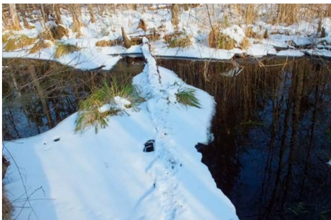
Tracks of wolves crossing backwaters.