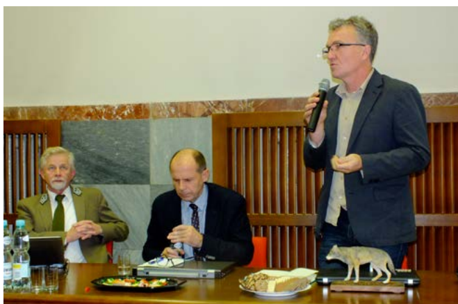
Wolf conference in Radom, November 2019