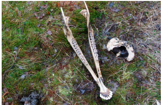
Remains of a moose eaten and probably killed by wolves

On the 30 th of August 2018, the PS pack responded to a howling stimulation. There were 4 adults and at least 4 pups howling. A local forester also heard the pack howling spontaneously in December 2018. In the early morning (05:00) of the 13 th of September 2018, a fisherman spotted 5 wolves coming to the artificial lake in the village of Bliżyn to drink. The lake is situated in the northern vicinity of PS. Interestingly, wolves approached the lake in the middle of a recreational area, which is very crowded during hot summer days. Wolves drank and then headed back north to the forest. Adult wolves have been also observed several times by foresters and forest workers. During fall and winter, we registered tracks and scats of wolves all over the forest. The maximum group size that we recorded was 6 wolves (tracks on snow). In February 2019, we found remains of a dead moose. There were 2 fresh wolf scats and wolf footprints on mud (there was no snow). Wolves apparently ate the moose, but we do not know if they killed it.